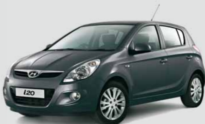
Dark Grey (Mica)