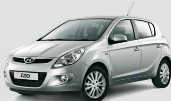
Sleek Silver (Metallic)