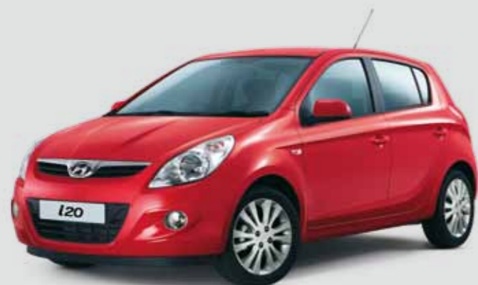
Electric Red (Solid)