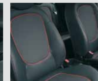
Leather and Cloth