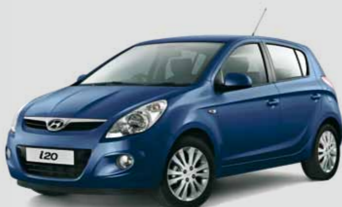
Sparkle Blue (Mica)