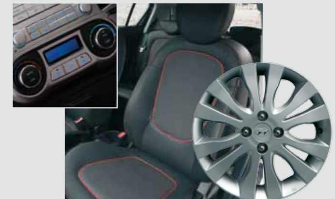
Leather trim with cloth inserts