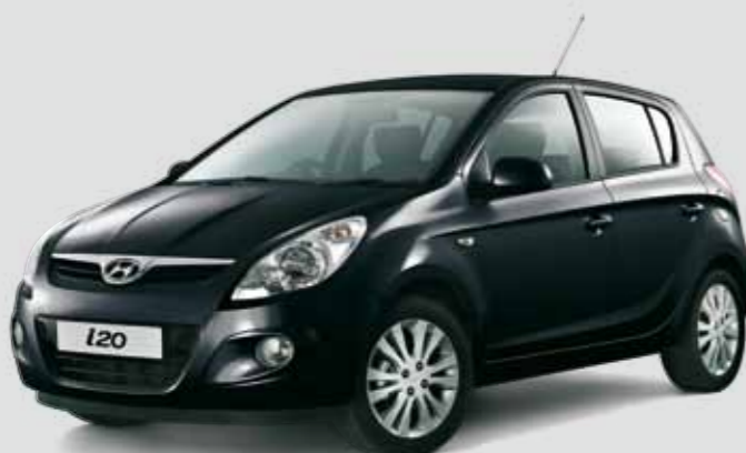
Black Diamond (Mica)