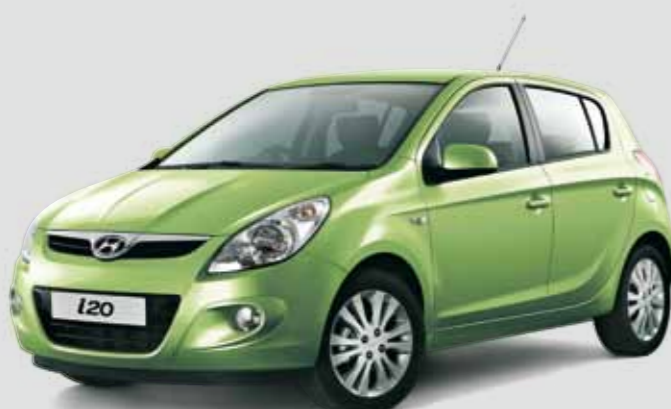
Electric Green (Mica)